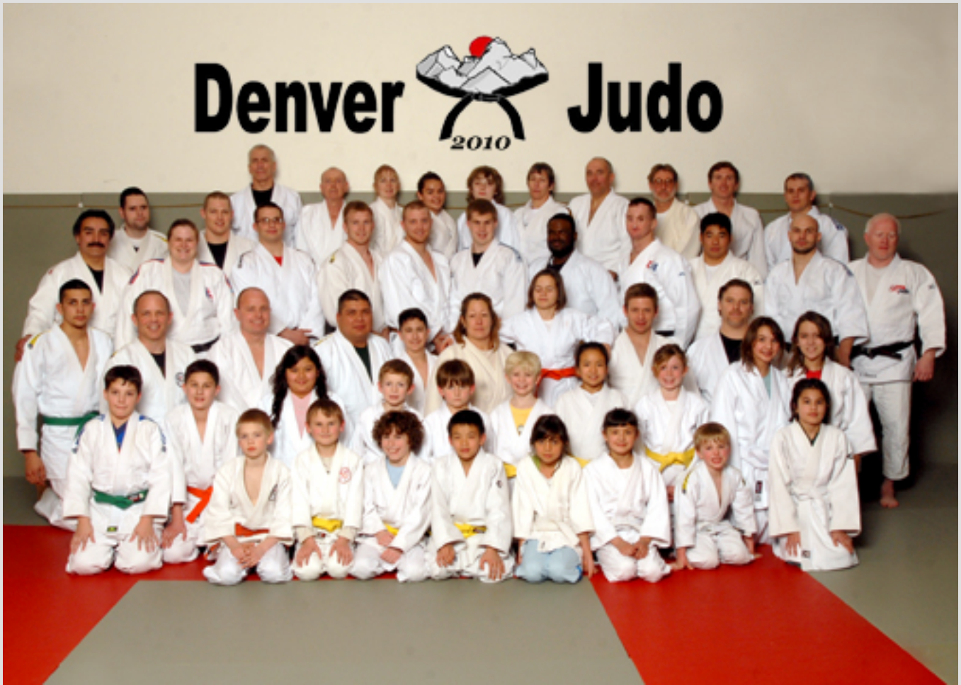
2010 Team Photo